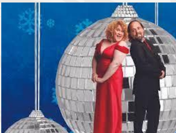
Santa Claus is Coming to Town

Reception Staff- receptiontarragal@thc.net.au