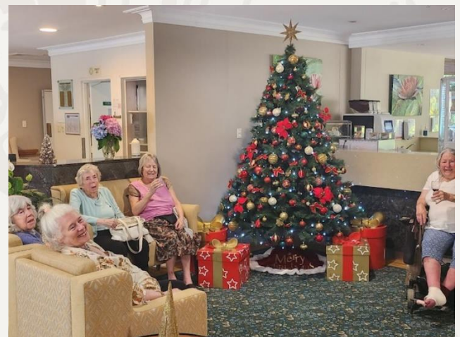
Our Beautiful Ladies Enjoying the Christmas Spirit