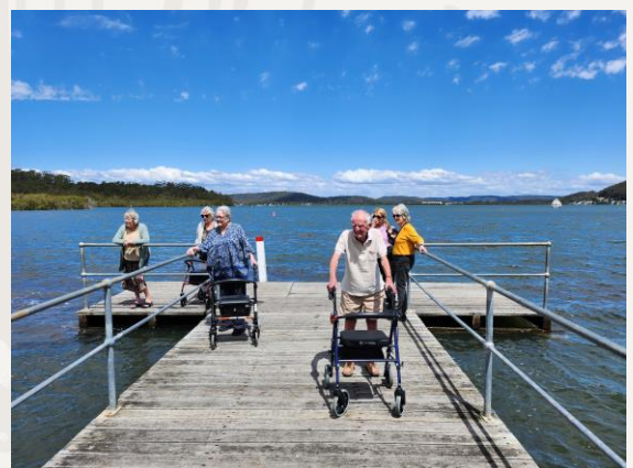
A Perfect Day on the Water