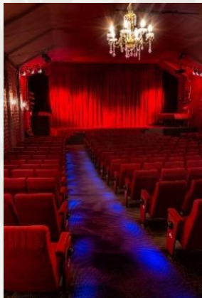
Avoca Historical Theatre

Following several trips to our local cinema our residents have requested more movie and lunch outings. The RAO team have recently coordinated with our local Avoca Beach Historical Theatre to hold monthly movies and supply fish & chips for lunch from Avoca Beach Seafoods. Currently the theatre is under refurbishment, and we are very excited to see the changes when we visit next month.