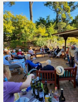
Sunshine and Ball Games with a Twist

We are looking forward to enjoying more impromptu outdoor activities on warmer days. Last week we ventured outside for ball games and happy hour in the sun. These activities capture so many important areas such as mobility and social engagement with a shot of Vitamin D.