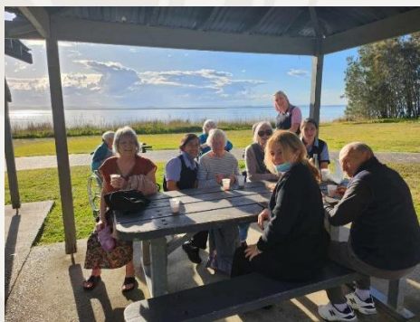
Stopping for a quick break