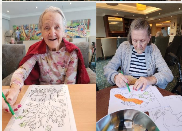
Arts and craft