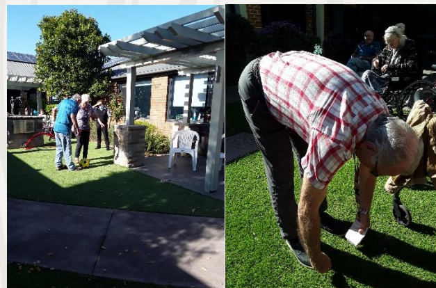
Indoor and outdoor ball games and exercise.