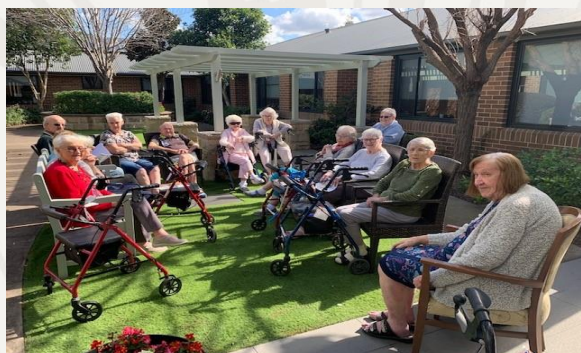
Fun in the sun