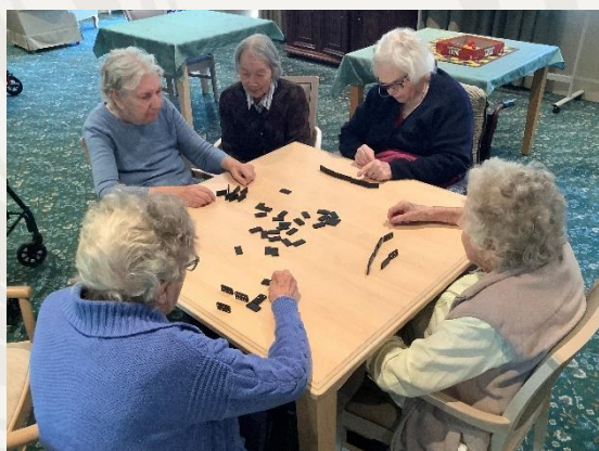
Pictured: Residents enjoying a game of Dominoes

The men's club continues to meet bi-monthly and discuss a range of topics. It's a great way to meet others and share life experience and interests.