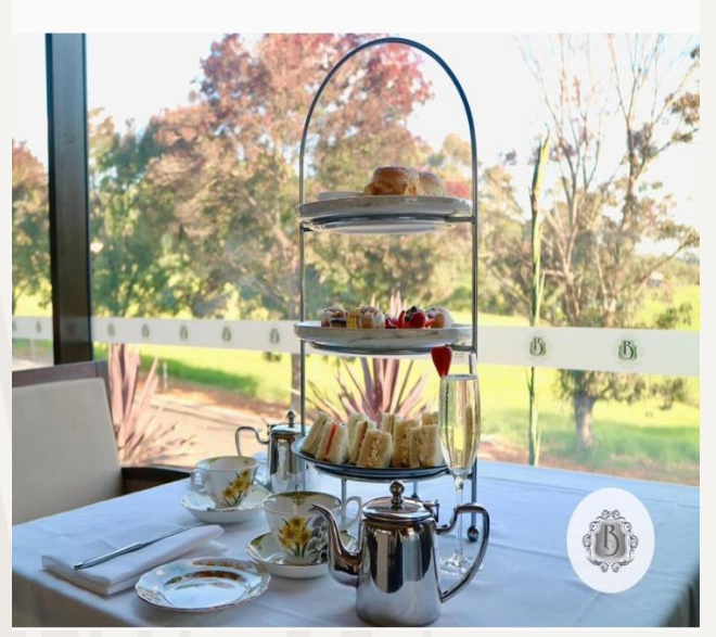
Mother's Day High Tea outing at Bivianos restaurant in Dural

Residents celebrated Mother's Day on Sunday 11<sup>th</sup> May with many family visits, lunch outings and gifts of chocolates from Wahroonga House staff and management. In addition, on the 8th and 15<sup>th</sup> May, bus outings were arranged to take residents for High Tea at a wonderful restaurant, Bivianos in Dural.