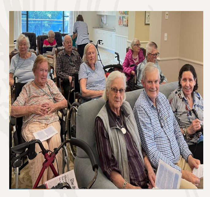
Residents enjoying the recital concert

On Sunday 14<sup>th</sup> April a recital concert with the Hornsby Instrumental choir was arranged to entertain the residents of Wahroonga House. There were many other highlight activities over the past few months including a bus trip for lunch at the local Waitara Magpies club, Armchair travel presentations to Indonesia, Belgium and even a safari to Kenya!