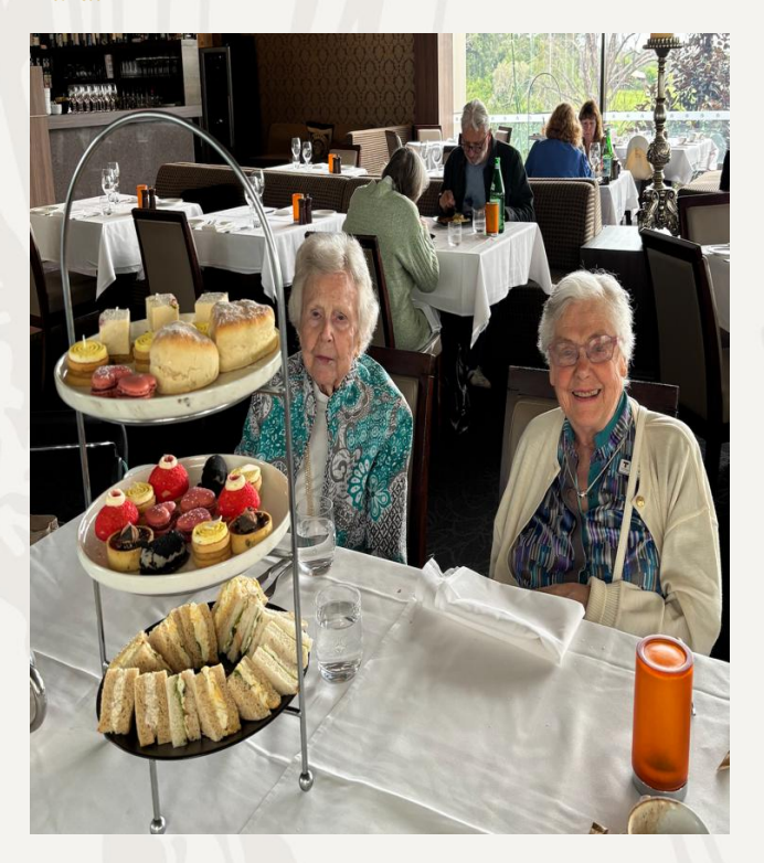
Residents enjoying Mother's Day High Tea