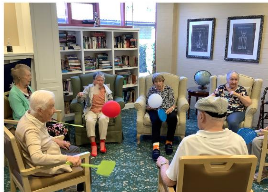
A very energetic fun game of Balloon Tennis