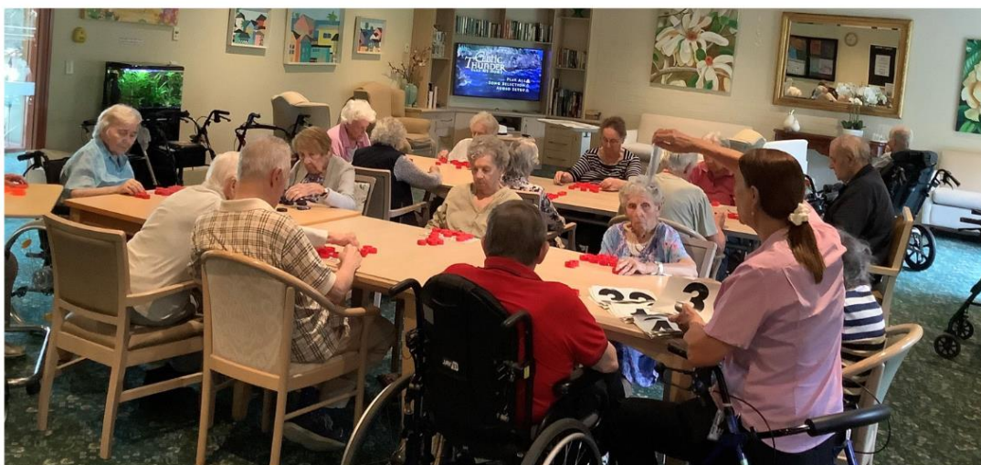
Residents enjoying a game of Bingo!