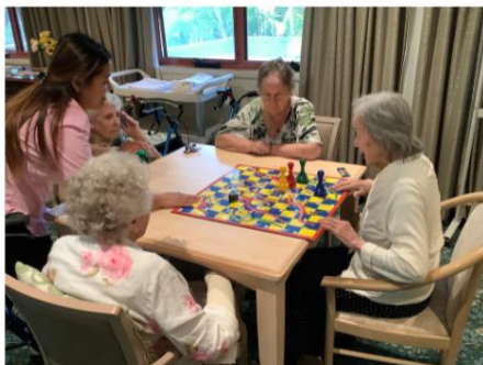
A relaxing afternoon playing board games