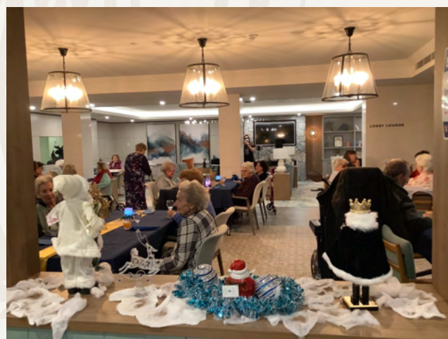
Our residents at Christmas in July Party