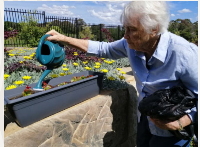
Resident from Banksia Wing enjoying watering plants