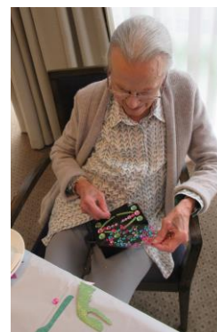
Hope creating a gift box at craft group