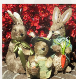
Look who we found in the garden!