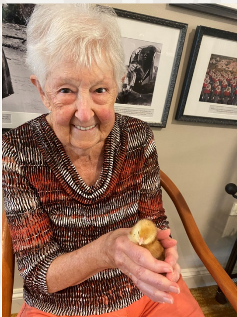
Cute and fluffy straight from the egg!!!