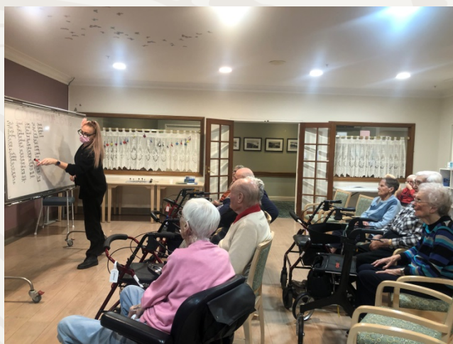
Build-a-word and Word wheel

Word Play and Build-a-Word are very popular activities on our weekly planner. A variety of words are picked from residents making it a fun filled, competitive afternoon.